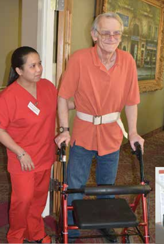
Rehab and Fitness Center